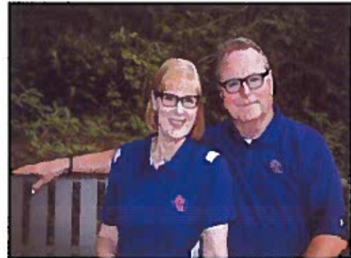
Citizens of the Year 2016 Awardees